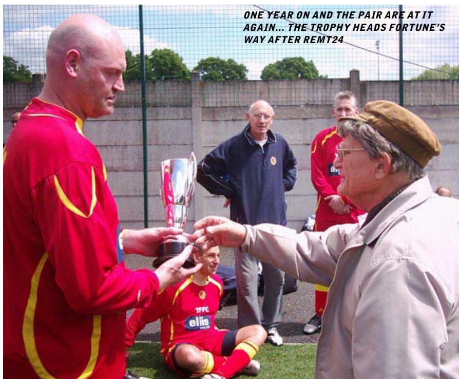
ONE YEAR ON AND THE PAIR ARE AT IT AGAIN... THE TROPHY HEADS FORTUNE'S WAY AFTER REMT24