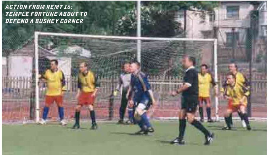
ACTION FROM REMT 16: TEMPLE FORTUNE ABOUT TO DEFEND A BUSHEY CORNER